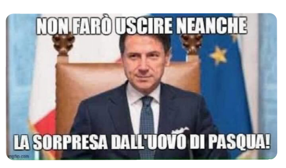
Figure 7. Commentary on measures | Italy