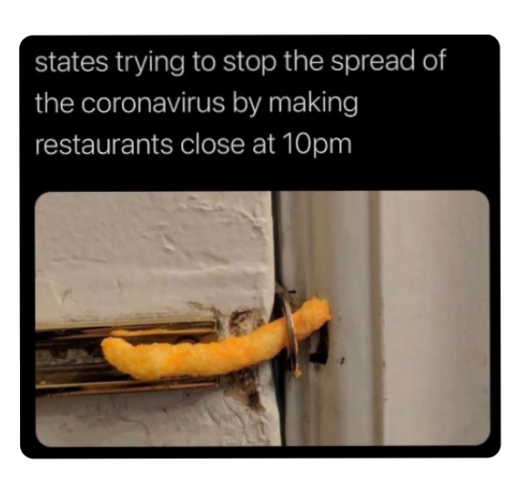
Figure 6. Commentary on measures | Sweden

Contrary to that are memes commenting on measures that are experienced as too restricting, as exemplified in Figure 7. The picture shows Italy's former Premier Giuseppe Conte making a speech to the citizens. The text captions state "I won't even let the surprise out of the Easter egg". Published in April 2020, this meme refers to the restrictions implemented in Italy during the Easter holidays, experienced as restricting by some.