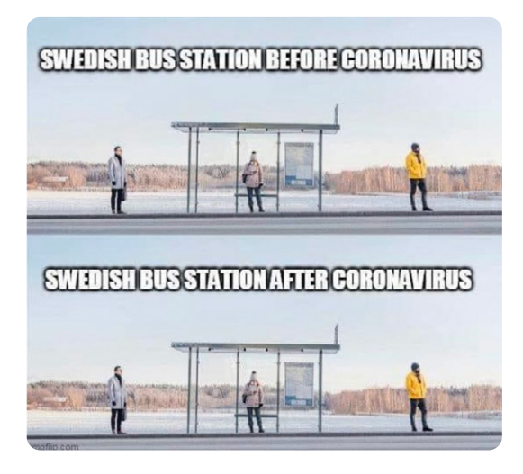
Figure 4. Everyday life during the pandemic | Sweden