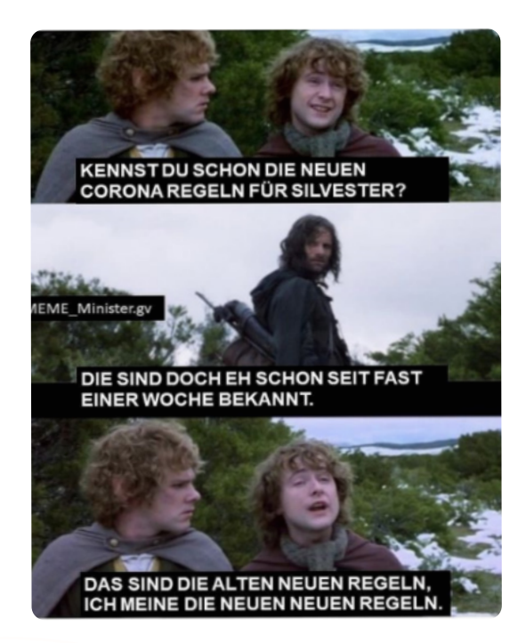
Figure 8. Commentary on measures | Austria

Finally, memes comment on the constantly changing nature of the pandemic, which means that governments often had to adapt measures, which - at times - was seen as confusing. One example from Austria is provided in Figure 8: in three screenshots of a scene in The Lord of the Rings. The Fellowship of the Ring, the text captions state Pippin saying: "Do you already know the new corona rules for new years?" to which Aragon says: "They are known already for a week." Pippin replies: "These are the old new rules. I mean the new new rules." This kind of commentary on the ever-changing nature of the measures, as well as the confusion when measures were modified slightly so differences were not entirely clear, could be found across the countries under analysis.