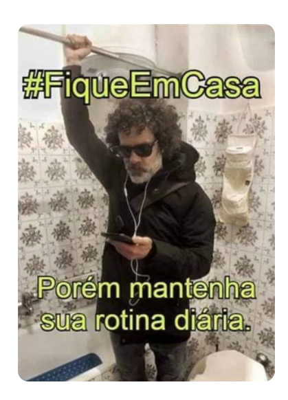
Figure 1. Everyday life during the pandemic | Portugal

Another example of coping with the disruption of 'normal life' is provided in Figure 2. The text says "When your hairdresser is closed, but the dog groomer who is working from home is still available". This is accompanied with a picture of a young man with a peculiar, poodle-like hairstyle. The meme refers to a time in Belgium during which hairdressers and other services were closed. In a joking way, it provides ideas for alternative ways to get a haircut. A similar example is shown Figure 3: a man with a smug smile, tipping his finger to his head, is accompanied by a text that reads "Wearing double mask at the gym is not bothering if you are not going to the gym". Posted in May 2021, when first restrictions were lifted, this image reacts to