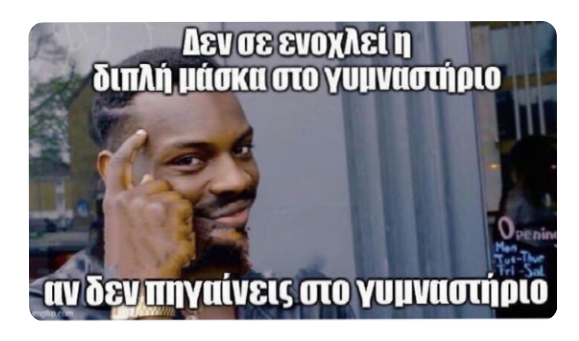
Figure 3. Everyday life during the pandemic | Greece

In a similar way, there are memes that comment on the everyday behaviour during the pandemic, often in a mild-mannered form of mockery. One example is the meme displayed in Figure 5 , which shows a picture of the actor Daniel Craig in the film 'James Bond'. The British secret agent is pointing a disinfectant spray, in place of a gun. Additionally, the actor is seen wearing personal protective equipment, a mask, as encouraged in public health recommendations to prevent the spread of coronavirus. The image was posted in early winter 2020, during the second wave of the pandemic. At this time, public health campaigns strongly emphasised adherence to hygiene measures. At this time in pandemic when vaccines were not yet available, and with increased risks of transmission during the winter months, behavioural strategies were the only means of protection that people could exercise.