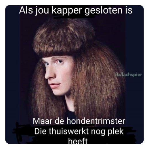
Figure 2. Everyday life during the pandemic | Belgium