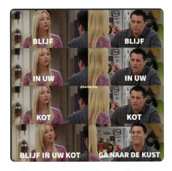
Figure 9. Commentary on behaviour | Belgium

Another sub-category are memes addressing hoarding (e.g., of toilet paper), which were mainly shared at the beginning of the pandemic. An example is Figure 10 : the picture shows as child eating breakfast. Instead of cereal, he is eating toilet paper. In the two speech bubbles above the picture, the boy asks, "Mom, when does this corona-story end?", to which she answers, "Shut