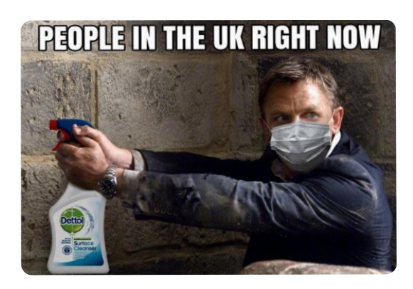
Figure 5. Everyday life during the pandemic | UK