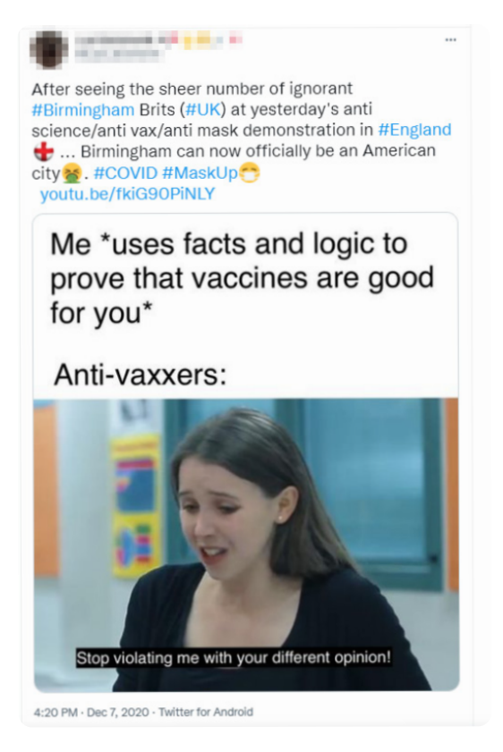
Figure 11. Commentary on behaviour | UK

This is one of several examples; across the countries under research, the often-emotional debate around the vaccines is taken up in memes reflecting on the subject.